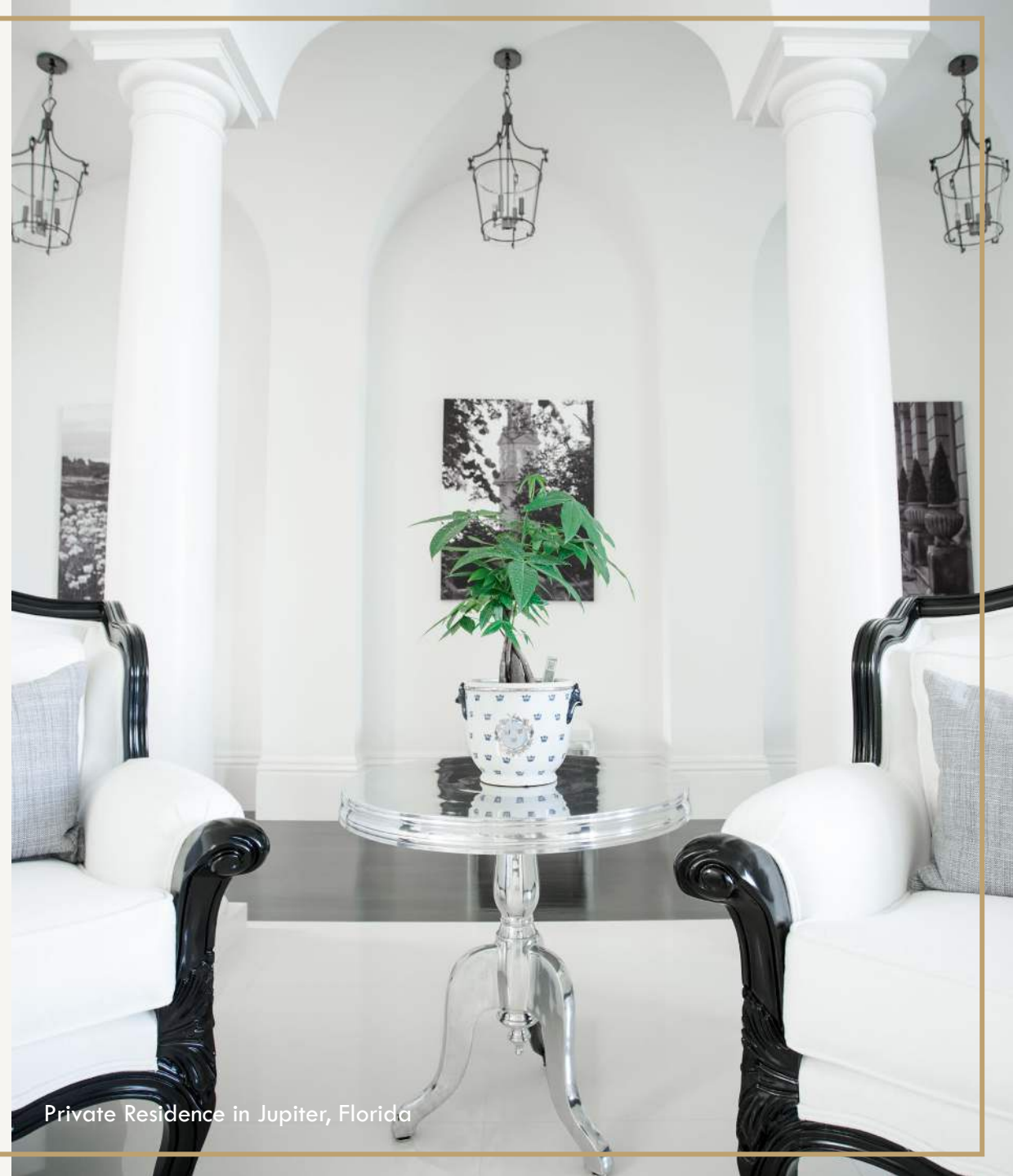
Private Residence in Jupiter, Florida

Inlet Decorating Company is based in Jupiter, Florida but with influences across numerous projects in Florida and internationally. Their designs are built on the fundamentals of Balance, Simplicity and Functionality, weaving in subtle details throughout their projects to produce timeless environments. The company approaches their designs as a tool for enhancing how their clients feel and interact with their environments to create airy and inspiring atmospheres.