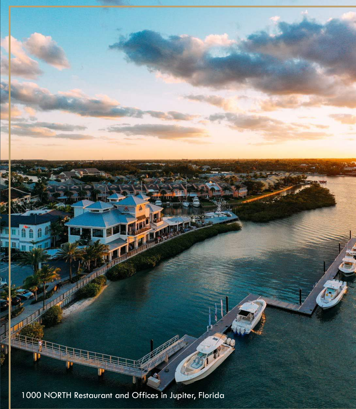
1000 NORTH Restaurant and Offices in Jupiter, Florida